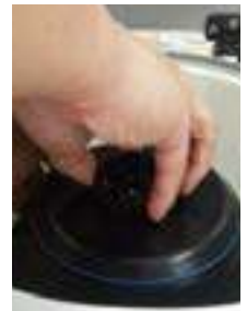
Picture 11 Screw-on lid