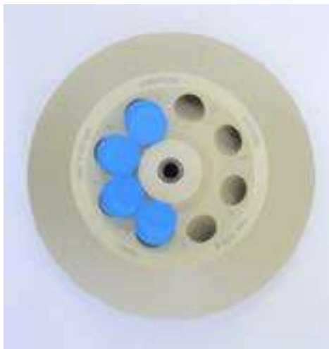
Picture 12 Wrong