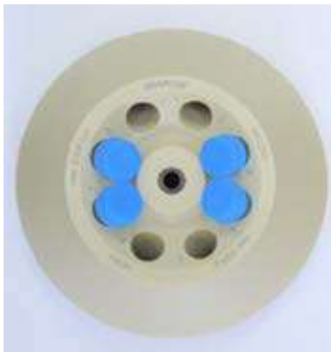
Picture 13 Correct