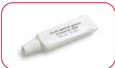
Vaseline (OHAUS pn: 30314586)